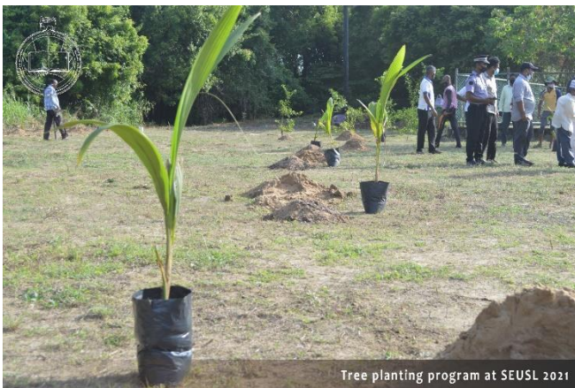
Tree planting program at SEUSL 2021