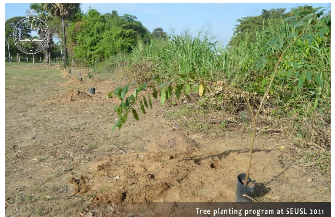
Tree planting program at SEUSL 2021